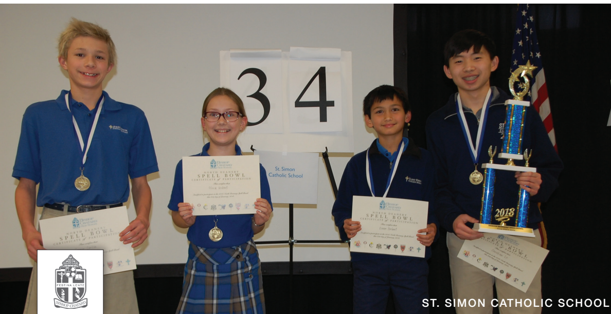
ST. SIMON CATHOLIC SCHOOL