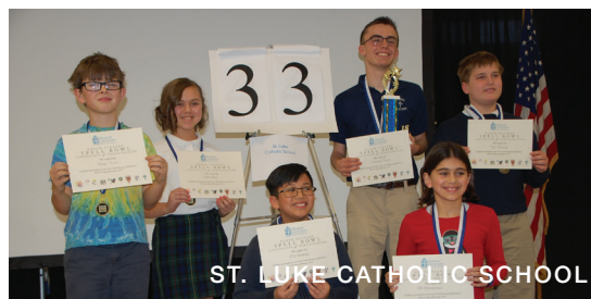
ST. LUKE CATHOLIC SCHOOL

Congratulations to all of the North Deanery Spell Bowl competitors, coaches and schools. The discipline and dedication on display during this academic competition was impressive!