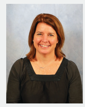
FACULTY & STAFF AWARD