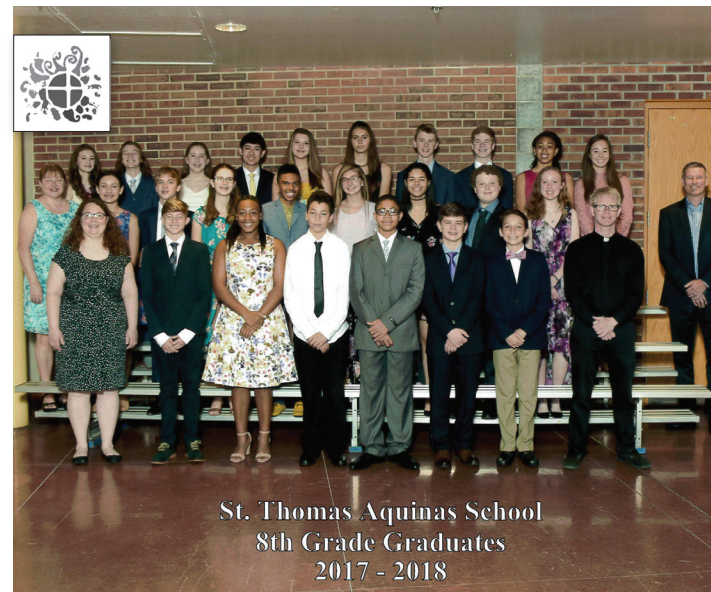
St. Thomas Aquinas School 8th Grade Graduates 2017 - 2018

As part of the recognition program, parents present their student(s) with a unique St. Simon alumni pin to wear during graduation. In addition, 8th grade students run through the hallways in their graduation gowns while parents and the entire student body cheer and shout! Running the halls is one of the most anticipated events for 8th grade students. A Graduation Mass and dance concluded the students' busy spring adventures as 8th graders.