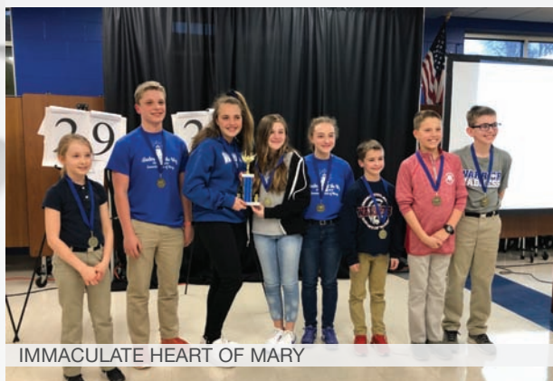
IMMACULATE HEART OF MARY