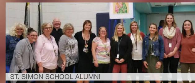
ST. SIMON SCHOOL ALUMNI

This special week, which included three school Masses, was a wonderful way to celebrate our patron saint, the holy lives of saints, and our faithfully departed.